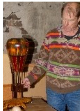
Chris Geiger—Tall segmented vessel with Birdseye Maple, Wenge, Paduk, Rosewood, Walnut and Curley Maple. Amazing Norfolk Island Pine lighted balloon with Zebrawood, Paduk, Walnut basket on burl base.