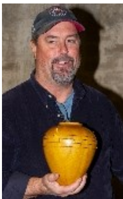
Doug McCulloch—Osage orange vase "Yellow Brick Road", Spalted Elm Platter with "bubble" rim, Tulip Poplar Vessel with Sea Fan finial