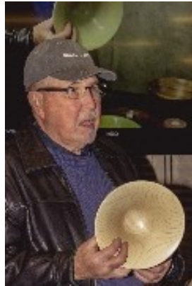
Dick Glover—Textured burned maple cube, Magnolia bowl, Dyed Magnolia bowl