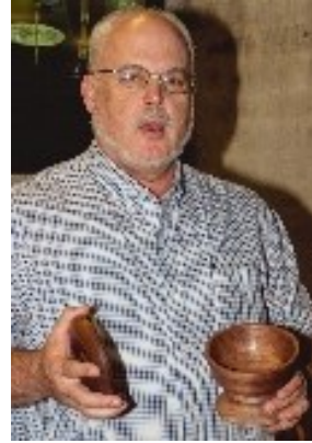
David Anliker—Walnut lidded box