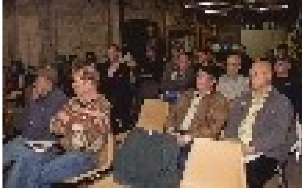
LCT members settling in for our first meeting at the historic GA Railroad Museum