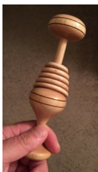
Baby Rattle with Captive Rings

I grew up on a cattle ranch in Montana, and learned how to turn wood over 30 years ago. I got into it more seriously in the last few years, now trying to turn a little every day. I mainly turn smaller projects such as pens, spin tops, and bowls that are made up of some of the more exotic woods of the world. I have also found that turning different manmade products can be quite fascinating.