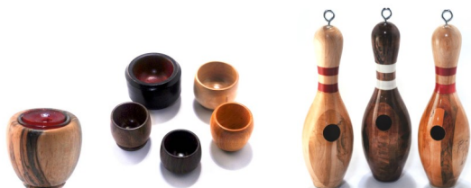
Sample turnings showcased during last month's meeting.

Pay your dues at www.lowcountryturners.com . Lowcountry Turners member dues for 2016 are $30/single for AAW members, $40/single for non members, $35/family for AAW members and $45/family for non members