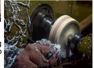
Al in the process of shaping the top