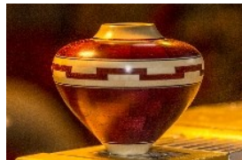
Roy Yarger—small segmented vessel