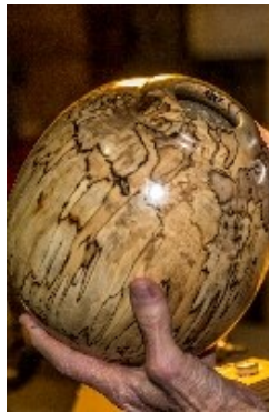
Dan Lee—Spalted Maple vessel