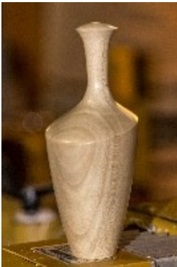
Barb Hahn—off center bud vase