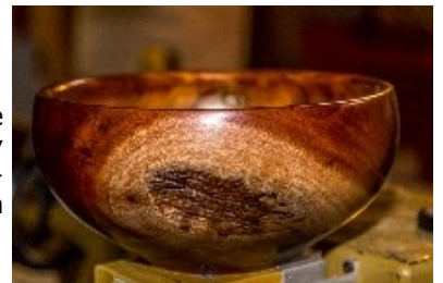
Barb Hahn—Large Cuban Mahogany bowl with bark inclusion