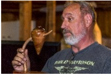
Mike St'Onge—Floating Pear, Walnut and Maple vessel on Cedar base