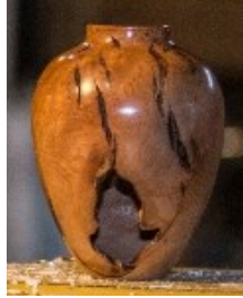
Noel Wright—small Mountain Laurel vase with voids