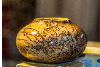
Dick Glover—small highly spalted Maple vase