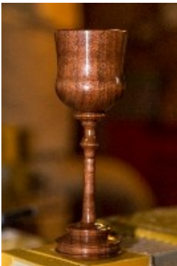
Barb Hahn—Walnut chalice