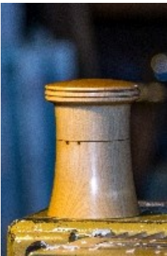
Fred Langley—Huron Pine lidded box