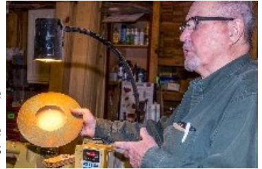
Dick Glover—Maple wide rim bowl with copper and turquoise surface treatments