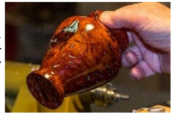
Dick Glover—small Jarrah burl vase with silver inlay