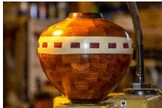
Roy Yarger—Segmented vessel, Bloodwood, Cherry, Maple