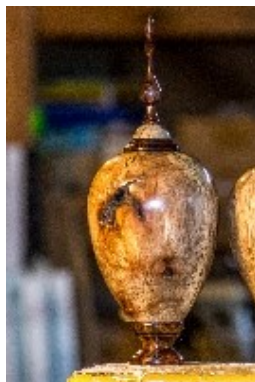
Noel Wright—Spalted Water Oak with Cocobolo finial