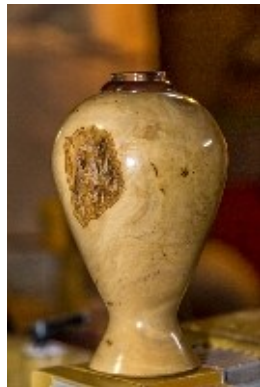
Barb Hahn—Burl bud vase with glass insert